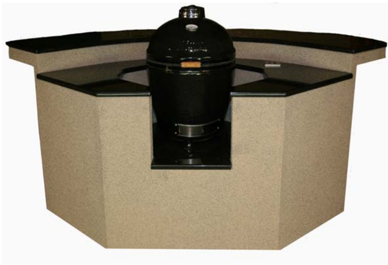
Kamado Kradle shown finished with Granitech housing a round Kamado and field supplied granite.