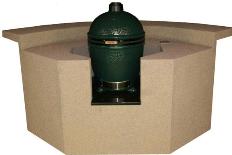
The Big Kahuna finished with Granitech with an optional field provided granite platform under the Kamado.

The big Kahuna can be shipped with or without the raised dining ledge as required for the installation.