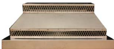
Photo shows how the Chase Shroud and the Chase Cover work in conjunction at the top of the unit.

Black powder coating of chase covers or shrouds is available